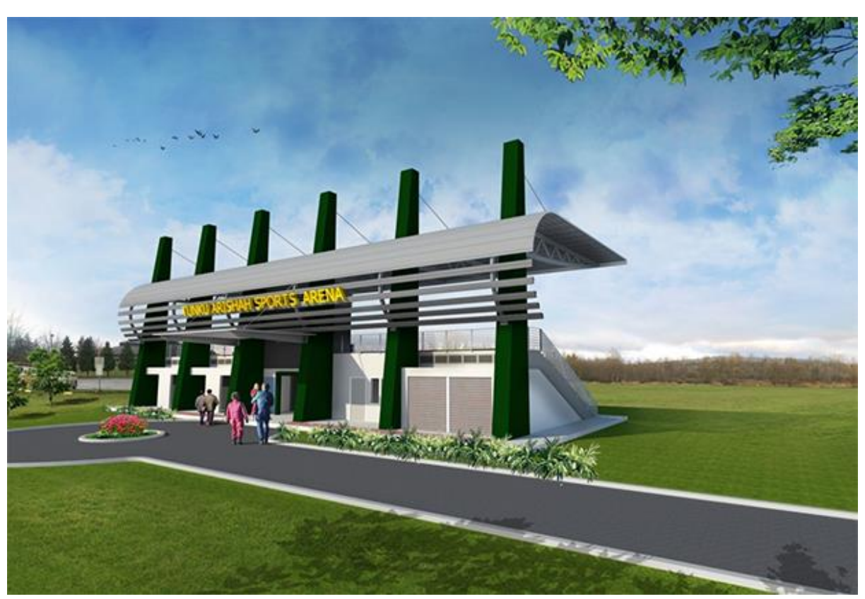
Artist's impression of the spectator pavilion (Front view)

TKC is a boarding school located in Bandar Enstek, Negeri Sembilan and was the first fully residential girls' school in Malaysia. The school has been awarded with the High Performance School award, a title awarded to the schools in Malaysia that have met stringent criteria including academic achievement, strength of alumni, international recognition, network and linkages. TKC currently has 715 students, aged 11 to 16 enrolled in the Middle Year Programme and 16 to 19 enrolled in the International Baccalaureate Diploma Programme.